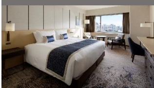
DELUXE KING (32.1㎡)