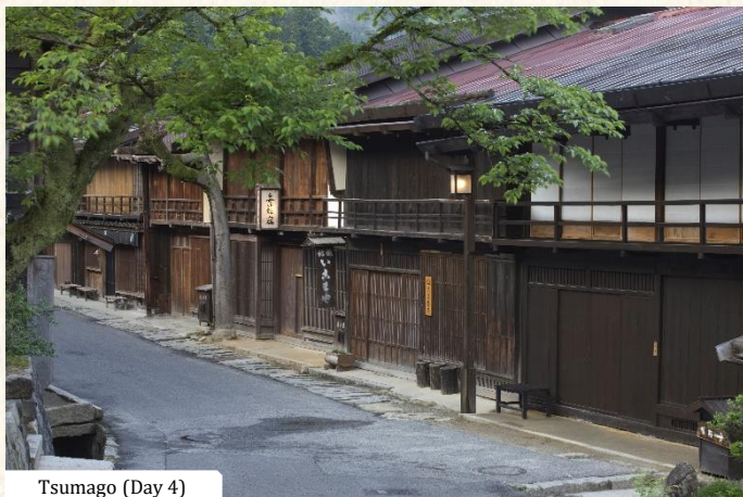
Tsumago (Day 4)