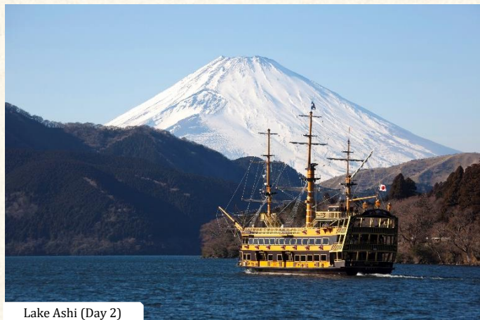
Lake Ashi (Day 2)