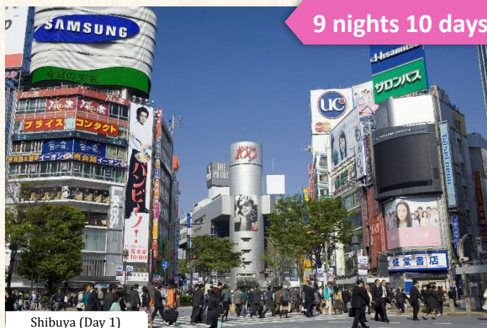
Shibuya (Day 1)