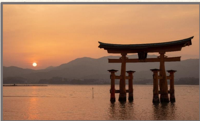
Itsukushima Shrine (Day7)