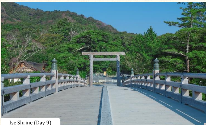
Ise Shrine (Day 9)