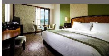
HANAKOJI FLOOR DOUBLE (22㎡)