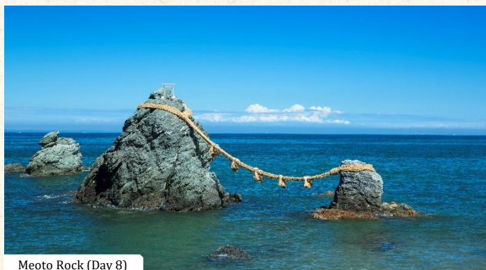
Meoto Rock (Day 8)