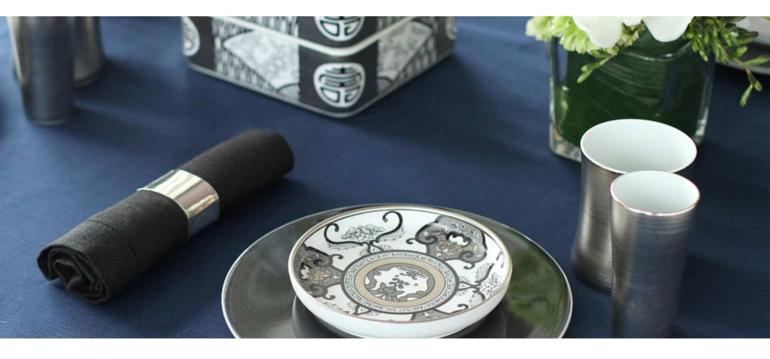
Pure Nippon Experience - Arita Ware factory visiting & Painting experience -