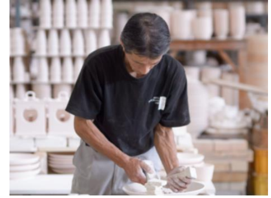
The Craftsman of Arita Porcelain Lab