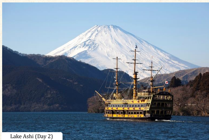
Lake Ashi (Day 2)