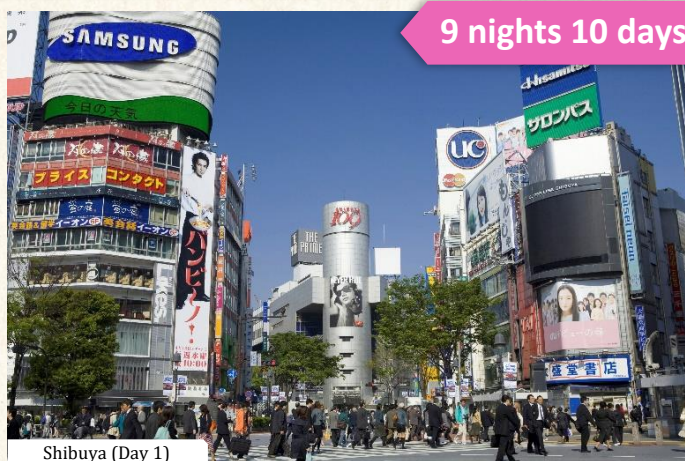
Shibuya (Day 1)