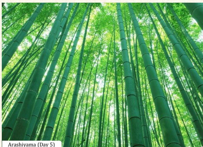
Arashiyama (Day 5)