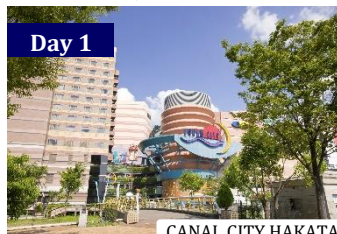
CANAL CITY HAKATA