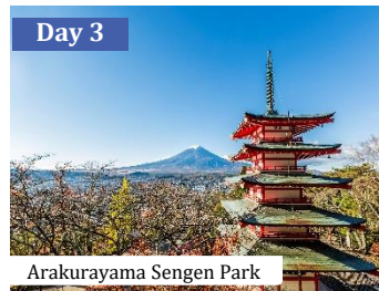
Arakurayama Sengen Park